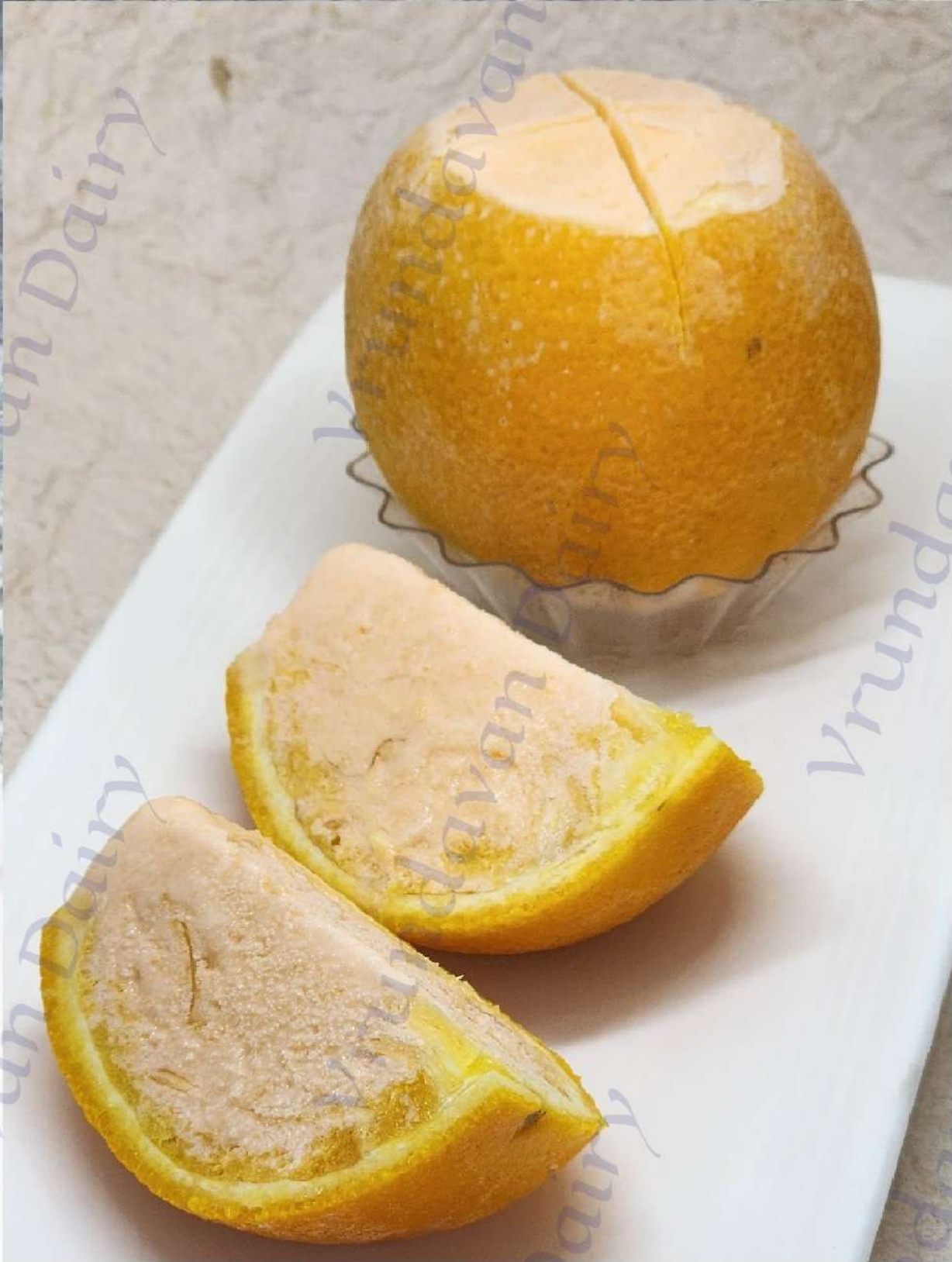
Orange Tinge in Orange