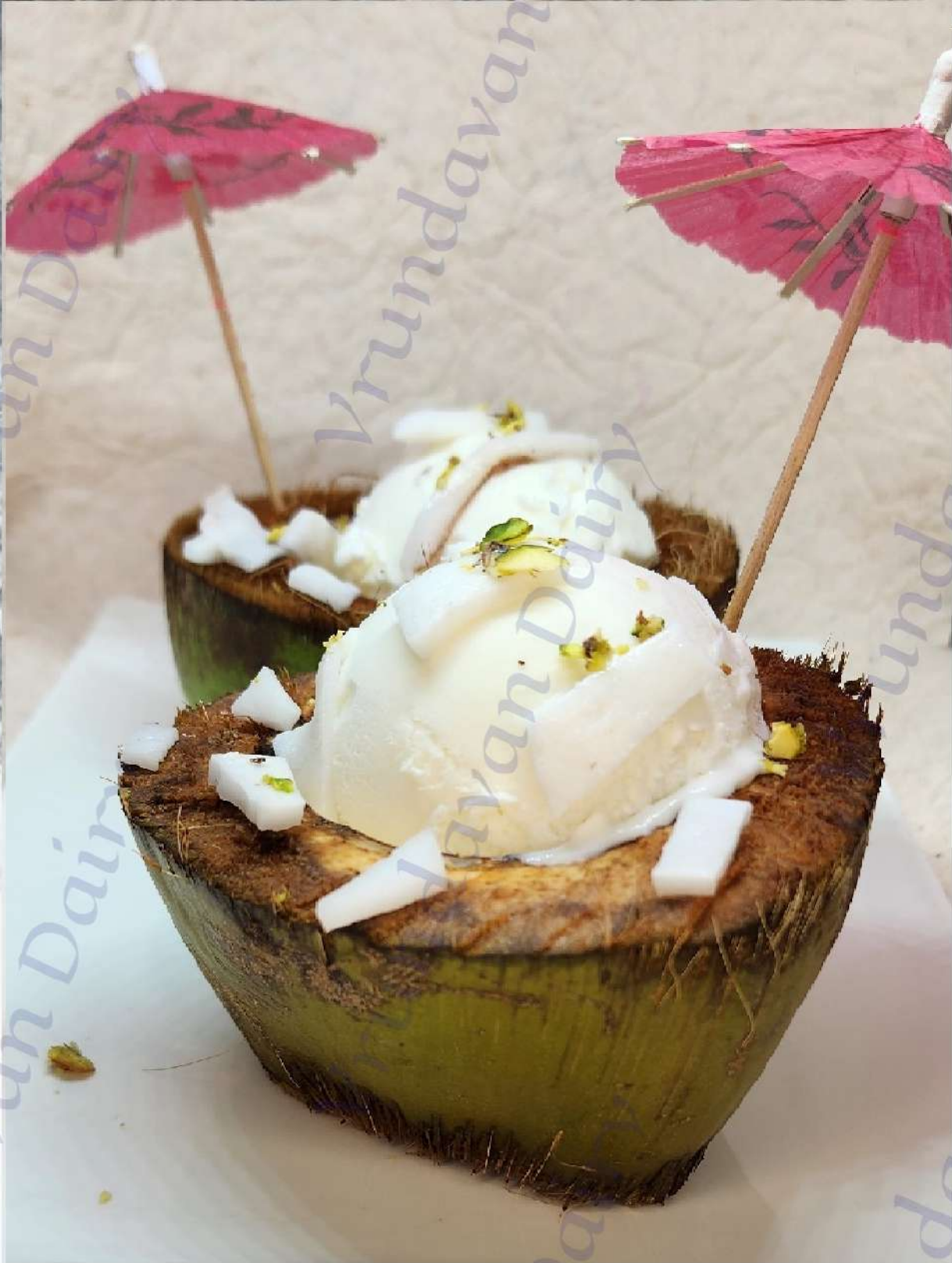
Coconut Tender in Coconut